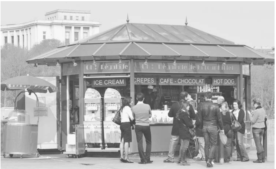
Fast food shop near the Eiffel Tower in Paris, France.

One is more likely to find street food in walkable neighborhoods of the biggest cities, especially the central and historical districts. In Paris, street food is sold in the Marais, the Latin Quarter, and Ménilmontant. But the neighborhoods of Chateau Rouge and Belleville, which have large immigrant populations, have the largest